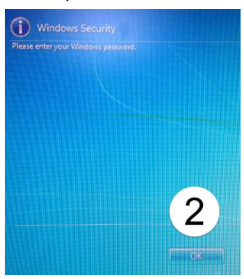
(You will see images similar to the ones pictured.)