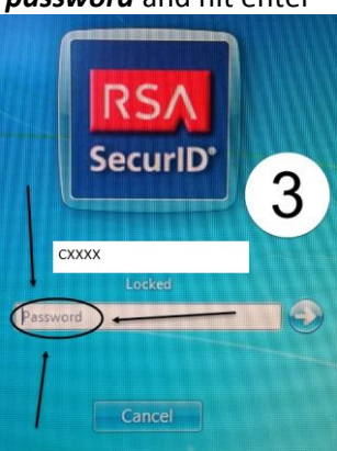
Step 3: Enter your password and hit enter